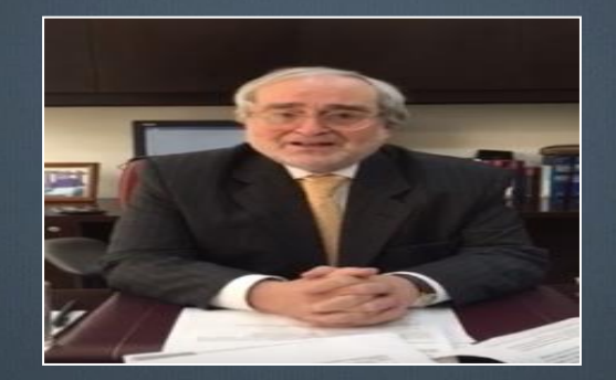
Ibarra Abogados Colombia