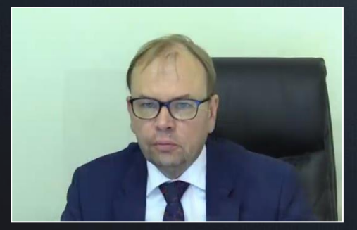
Competition Authority, Estonia