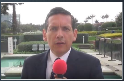
Supertintendence of Industry and Commerce, Colombia