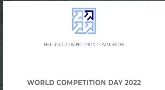
Hellenic Competition Commission Greece