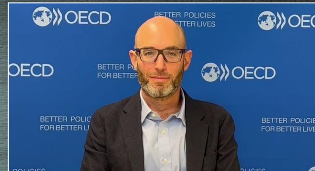
Organisation for Economic Co- operation and Development (OECD)