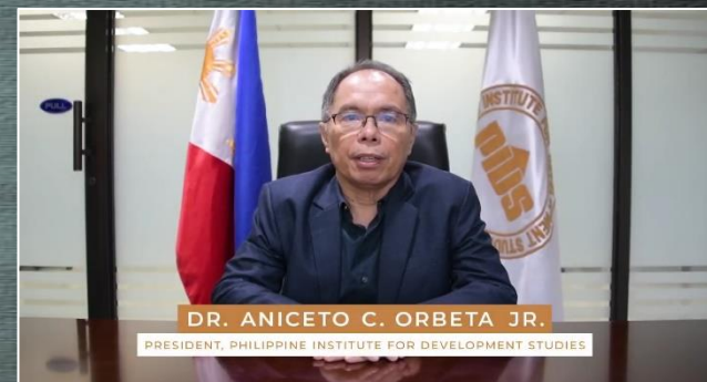
Philippine Institute for Development Studies (PIDS), Philippines