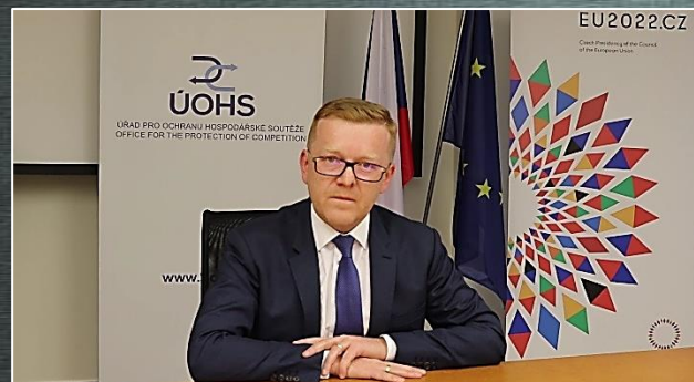
Office for the Protection of Competition, Czech Republic