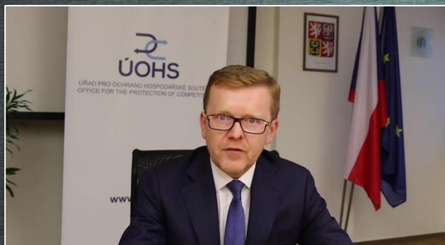
Office for the Protection of Competition, Czech Republic