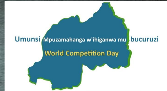
Rwanda Inspectorate, Competition and Consumer Authority (RICA)