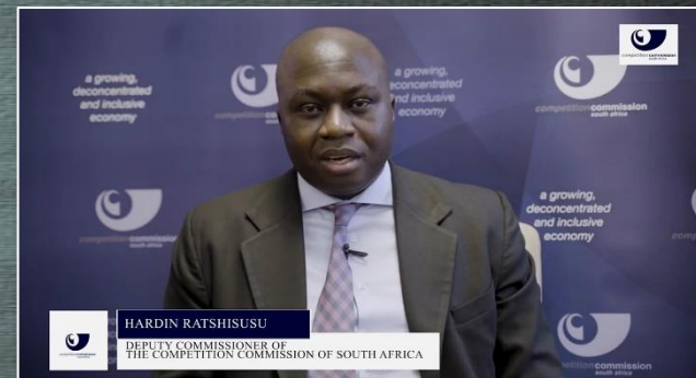
Competition Commission of South Africa