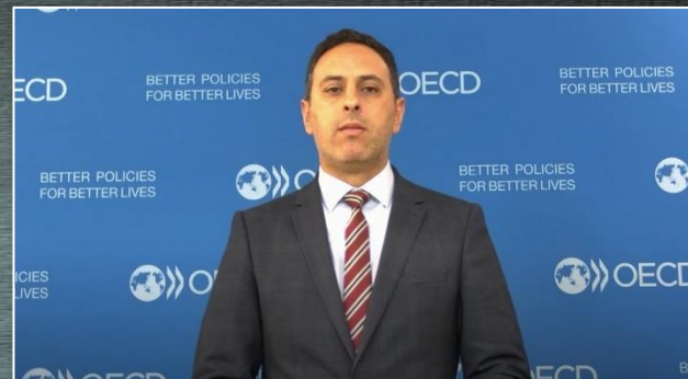
Organisation for Economic Co- operation and Development (OECD)