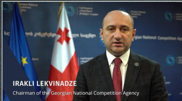
Georgian National Competition Agency Georgia