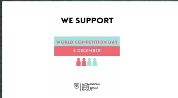
Antimonopoly Office of the Slovak Republic