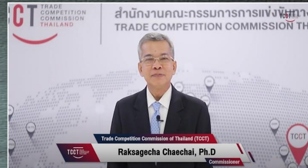
Trade Competition Commission of Thailand (TCCT)