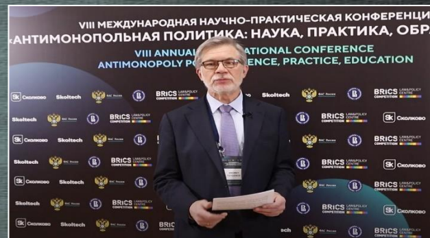
Federal Anti-Monopoly Service Russia