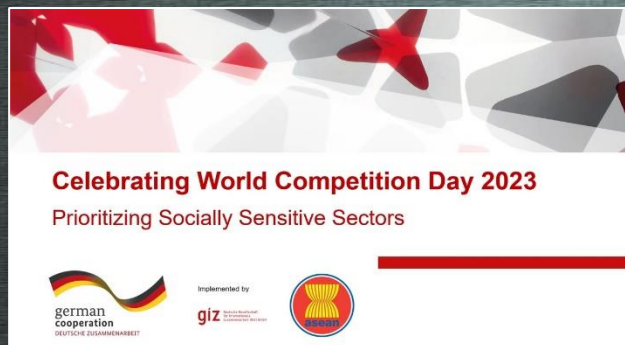
Deutsche Gesellschaft für Internationale Zusammenarbeit (GIZ)