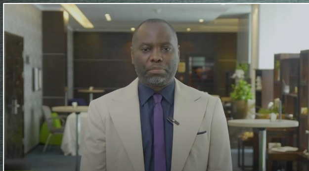
COMESA Competition Commission Malawi