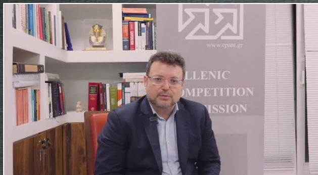
Hellenic Competition Commission Greece