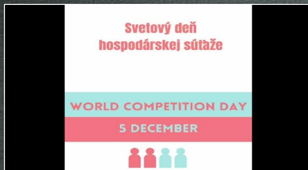
Antimonopoly Office of the Slovak Republic