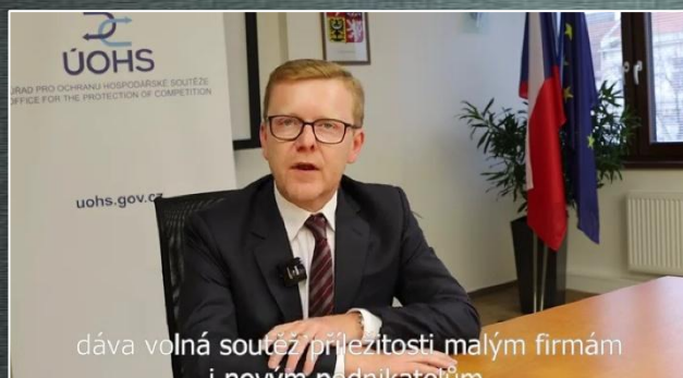
Office for the Protection of Competition, Czech Republic