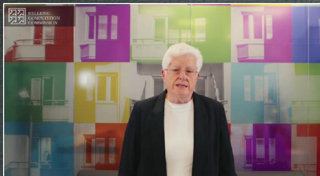
Hellenic Competition Commission Greece