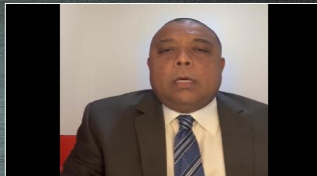
Trinidad and Tobago Fair Trading Commission