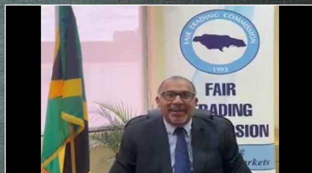
Fair Trading Commission Jamaica